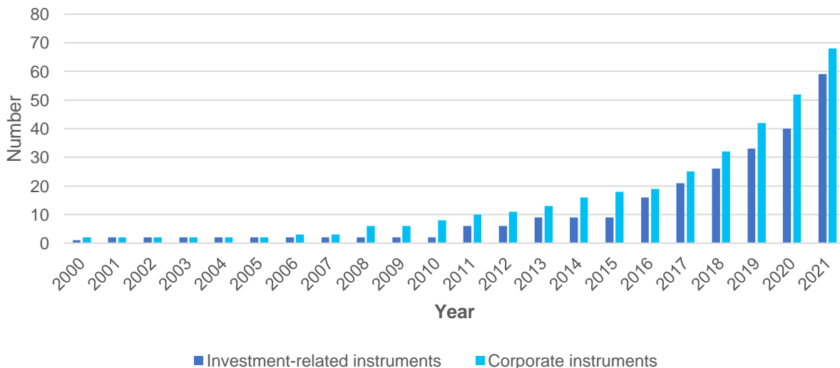
Figure 2: Growth in ESG reporting instruments over time (to October 2021 5 )

Figure 2 shows the cumulative trend in the total number of ESG reporting instruments, distinguishing between corporate instruments and those relating to investments. There has been a clear acceleration in the growth of both types of ESG reporting instruments over the last 20 years, with investment-related rules proliferating particularly fast since 2011.